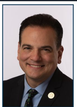
Assembly Speaker Craig Coughlin