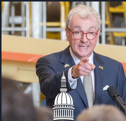
Governor Phil Murphy